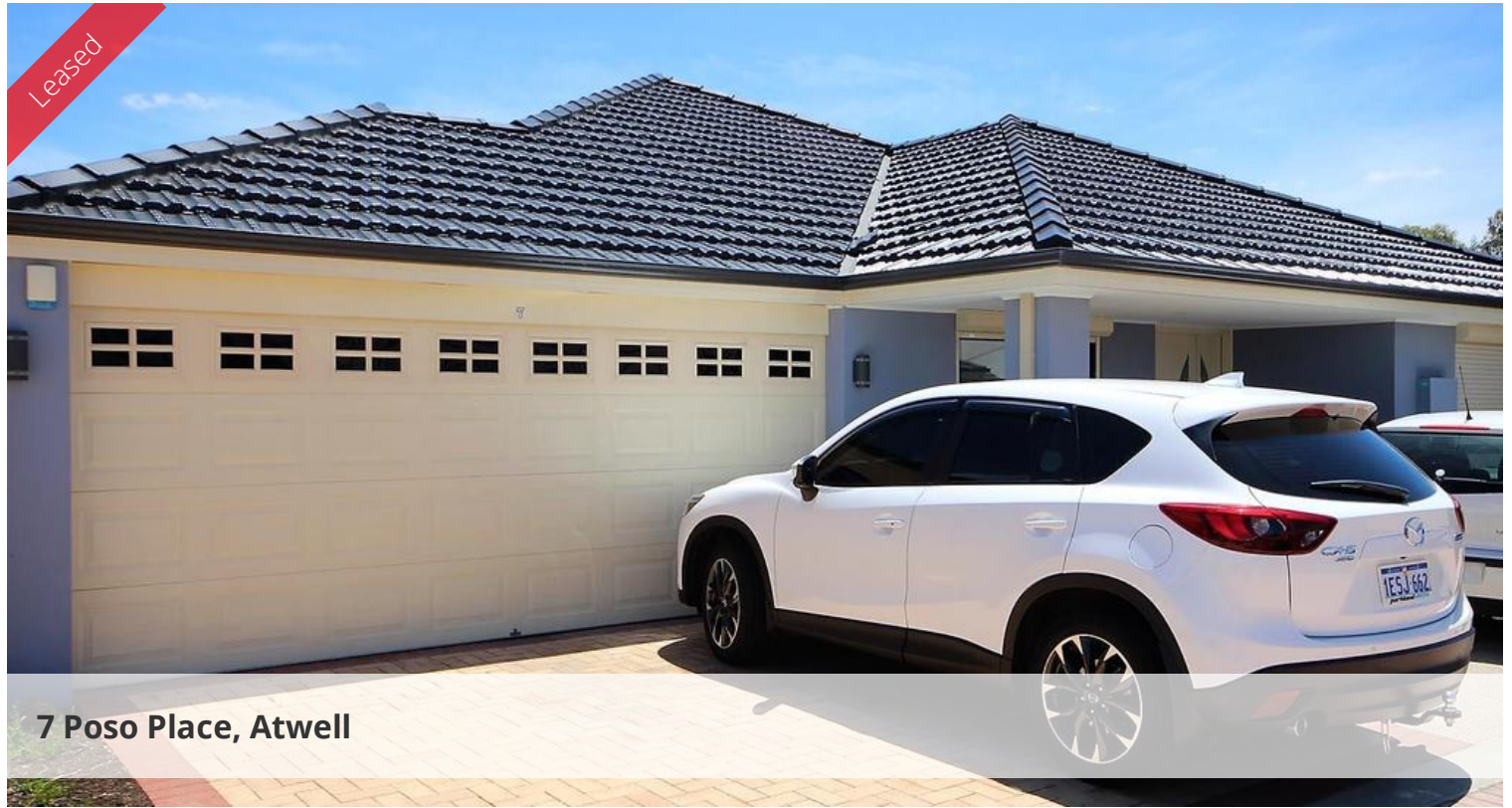
7 Poso Place, Atwell