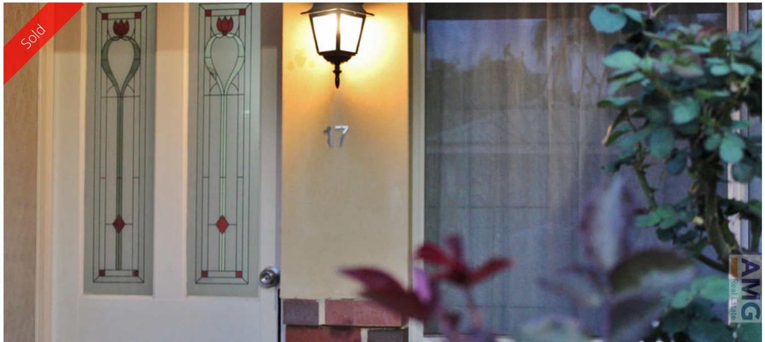
17, 33 Paddington Court, Bibra Lake