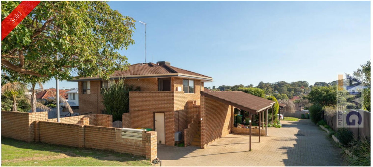
Unit 4, 31 Harris St, Bicton